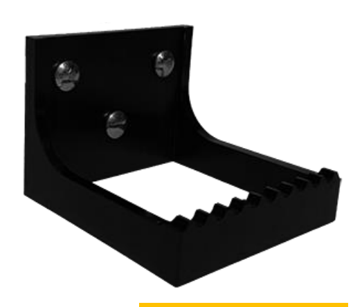
Live Hands Free